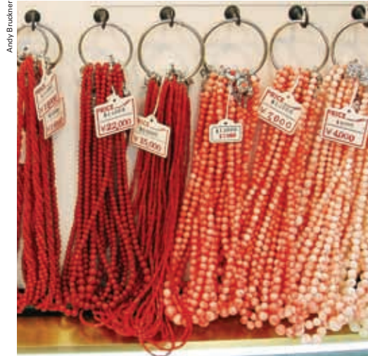
Pink coral ( Corallium ) jewelry for sale in Japan. Pink and red precious corals have been valued for jewelry and art objects for over 5,000 years.

Understanding and conserving habitats of high biological diversity, such as deep-sea coral habitats, is taking on increasing importance as NOAA moves towards an ecosystem approach to managing the Nation's living marine resources. Deep-sea coral habitats were highlighted for special attention in the 2006 reauthorization of the Magnuson-Stevens Fisheries Conservation and Management Act. In a similar vein, conservation of these vulnerable