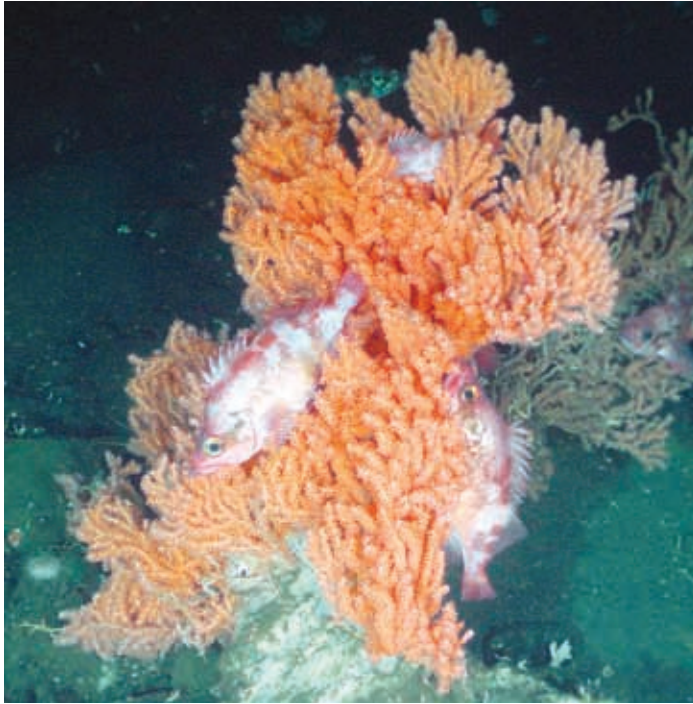
NOAA, Olympic Coast National Marine Sanctuary